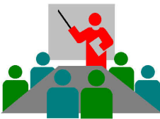
meeting, get together