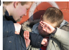
to bother, to bug